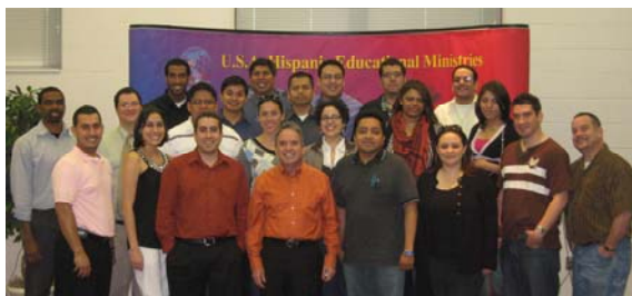
Attendees at First Summit for Hispanic Young Scholars for the Church of God.