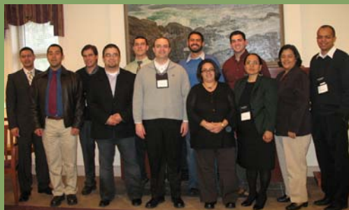
Attendees at this year's Selection Committee interviews.

HTI's Selection Committee members recently met in Princeton to conduct interviews with this year's group of finalists, and determined that three women and seven men met the strict criteria to qualify for a grant. During the event, the young scholars participated in a worship workshop and a writing workshop, both of which introduced them to concepts that will enrich their spiritual and academic careers. Agreeing that the interview process is one that causes much anxiety, the students also concurred in finding that the interviews also provide an invaluable experience in hearing feedback from seasoned scholars whose only goal is that of supporting them in achieving their success as academics and also as leaders in their communities. We congratulate the new grant recipients and look forward to witnessing their progress in the new academic year.