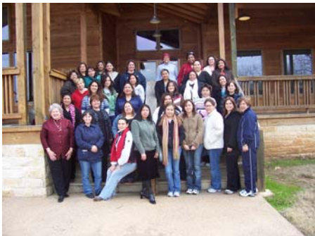
Attendees at the Latina Leadership Institute Training session.