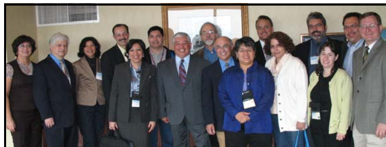
HTI graduates and contributors were all smiles at the program's tenth anniversary celebration.