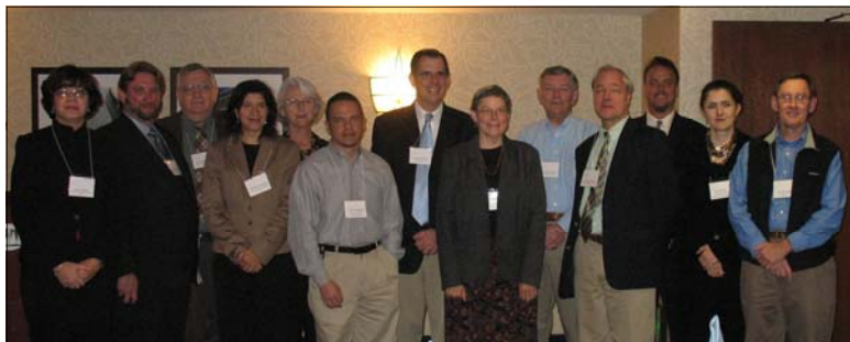
Attendees at the Hispanic Theological Initiative Consortium inaugural meeting.